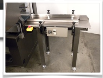
Optional 3' or 6' flighted or belted infeed conveyor - increases speed

The new PP-5600 E-Combo is a fully automatic l'sealer and PP1808-28 tunnel that is sold as a set or individually. This lower cost, entry level, fully automatic system is great for customers who have one or two semi automatic l'sealers now and need more speed or want to automate without spending a lot of money.