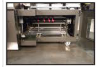
Easy front load film cradle with pin wheel hole punch