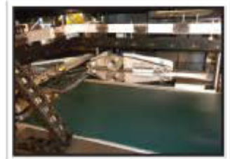
Vertical seal head with one piece seal knife and blade