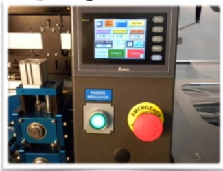
Delta touchscreen with 10 program memory