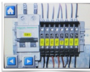
Access fuse screen from front control panel for easy diagnostics