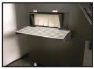
Re-circulating air chamber with live roller conveyor